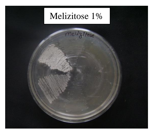
Fig 5a: Utilization of carbon source

In present study all the isolates grew well on the medium containing up to 2% NaCl. Five test isolates i.e., TS5, TS18, TS21, TS35 and TS39 exhibited growth at 7% NaCl and only one isolate i.e., TS39 showed poor growth in 9% NaCl. All test isolates were found to tolerate a wide range of pH from pH 4 to pH 11. Most of the isolates i.e., TS1, TS3, TS5, TS10, TS15, TS18, TS19, TS22, TS29, TS34, TS30, TS35, TS36, TS39 and TS40 recorded growth at pH 4.3