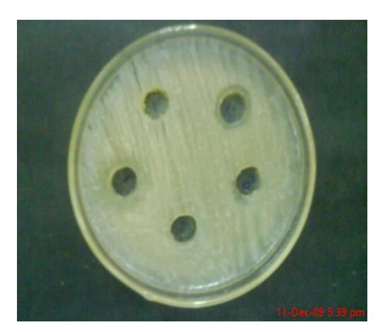
Fig 6c: Antimicrobial activity of TS1 and TS5 against E. coli .