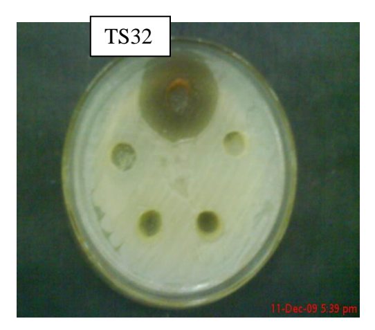
Fig 6a: Antimicrobial activity of TS32 S. chromofuscus against C. albicans

A wide range of carbon compounds were utilized by the Streptomyces isolated from soil of Raipur district of Chhattisgarh. The best carbon sources were mannitol, meso-inositol, L-rhamnose, D-melebiose, raffinose and sucrose. Five isolates i.e. TS18, TS22, TS29, TS30, and TS37, exhibited growth in adonitol. Five tests isolates i.e. TS10, TS15, TS18, TS19 and TS30 exhibited growth in xylitol and only three isolates i.e. TS15, TS18 and TS30 exhibited growth in D-melezitose, (Fig. 5a). All isolates exhibited growth in presence of L-histidine, and DL- \alpha -amino-n-butyric acid (Fig. 5b)