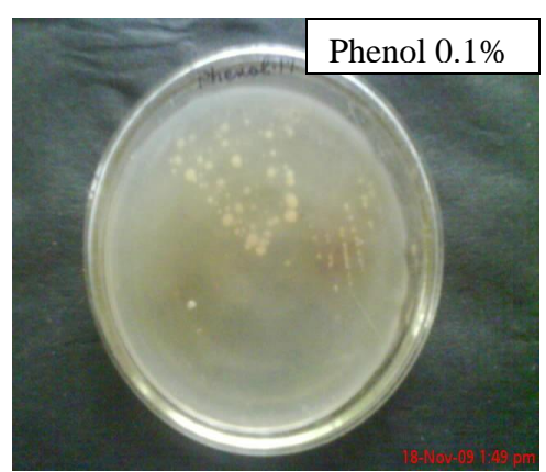
Fig 4: Effect of inhibitors on growth of Streptomyces (phenol 0.1%)