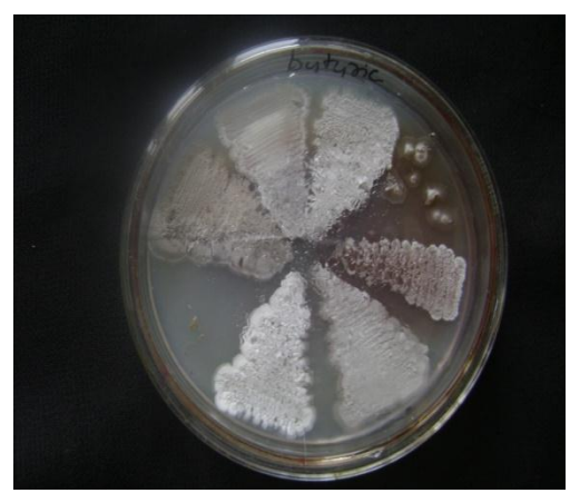
Fig 5b: Utilization of nitrogen source

A wide range of carbon compounds were utilized by the Streptomyces isolated from soil of Raipur district of Chhattisgarh. The best carbon sources were mannitol, meso-inositol, L-rhamnose, D-melebiose, raffinose and sucrose. Five isolates i.e. TS18, TS22, TS29, TS30, and TS37, exhibited growth in adonitol. Five tests isolates i.e. TS10, TS15, TS18, TS19 and TS30 exhibited growth in xylitol and only three isolates i.e. TS15, TS18 and TS30 exhibited growth in D-melezitose, (Fig. 5a). All isolates exhibited growth in presence of L-histidine, and DL- \alpha -amino-n-butyric acid (Fig. 5b)