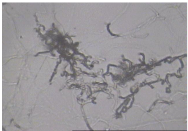
Fig. 1a: Rectiflexible spore chain of TS3 Streptomyces exfoliates (1000x)

Morphological, physiological and biochemical characteristics of the twenty isolates have been presented (Table.2). All the isolates were found to be gram- positive. Most of the isolates have rectiflexible spore chain morphology (Fig. 1a) and four isolates i.e.TS9, TS18, TS22 and TS42 exhibited spiral spores chain morphology (Fig. 1b).