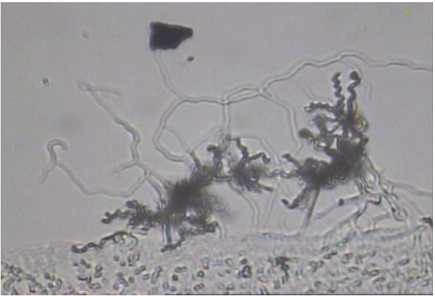
Fig. 1b: Spiral spore chain of TS18 Streptomyces phaeochromogenes (1000x)

Analysis of whole cell hydrolysate showed that all isolates contain LL- diaminopimelic acid indicating that they all belong to the genus Streptomyces (Fig. 2). Most actinomycetes isolated from any habitat are likely to be Streptomyces [10].