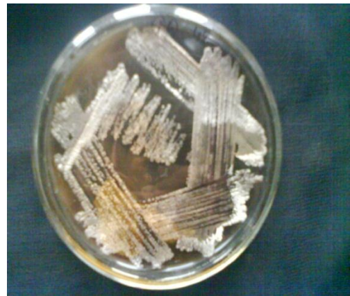
Fig 3: Melanin production in TS42 (S. olivaceoviridis) on tyrosine agar