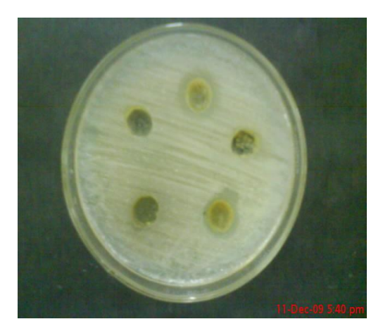
Fig 6d: Antimicrobial activity of TS35 and TS39 against E. coli

All isolates failed to grow in presence of Neomycin ( 30\mu g ) thus indicates their sensitivity for this antibiotic. Most of the isolates were found resistant to Penicillin G (10 units) and Rifampicin (5 \mu g ). Only two isolates i.e., TS18 and TS42 showed sensitivity to Olendomycin (15 \mu g ) showing no growth in presence of this antibiotic.